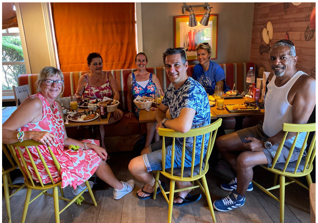
Mid Essex Support Group social breakfast at the Plough Harvester