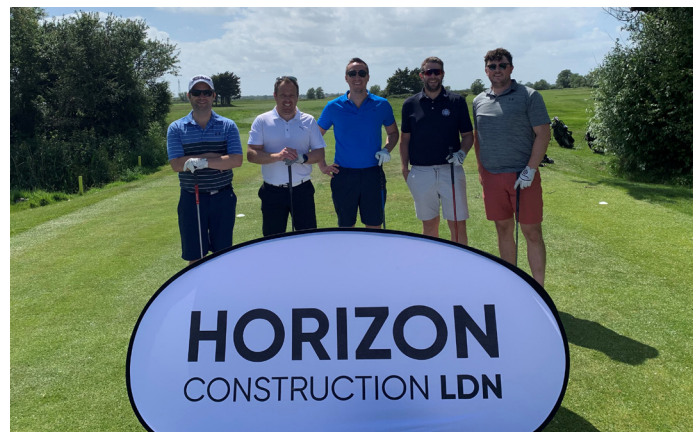
One of the many teams taking part on the day