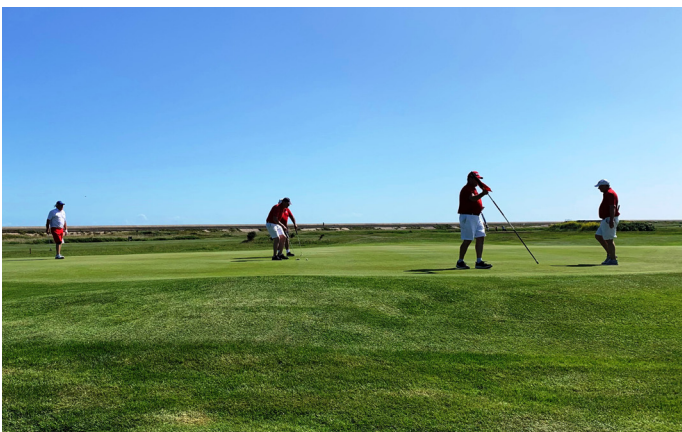
Golfers enjoying the beautiful weather

The Golf Day on 10th June raised £1,330.11 for Headway Essex.