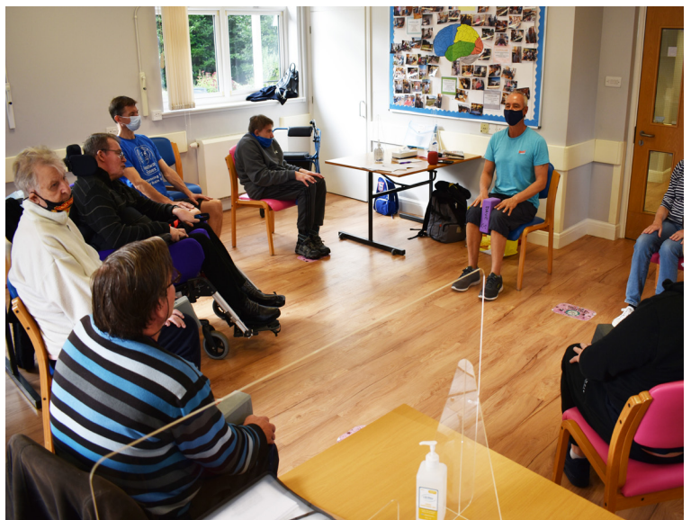
Clients participating in one of our yoga classes

The virtual groups are back by popular demand from service users who benefited from these services through lockdown. We will be running