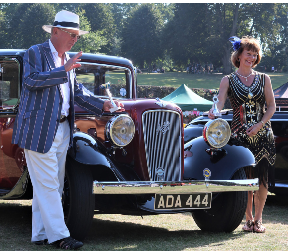
A 1936 Austin York won best in show