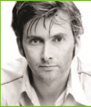
David Tennant, Headway Essex Patron